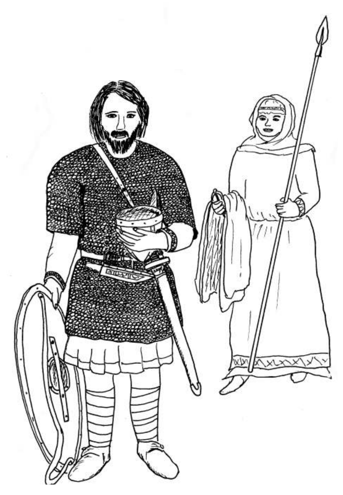
Page 30 of 40

The true aristocracy, thegns were well equipped and well dressed. The man has a good decorated woollen tunic, a linen undertunic, woollen hose with leg bindings, and turnshoes. For protection he has a padded gambeson (although most thegns would also wear a mailshirt), a conical helm, and a round shield. The woman wears an embroidered overdress over a linen underdress. Her wimple is of linen or silk and is secured with braid. She is holding the warrior's spear and cloak.